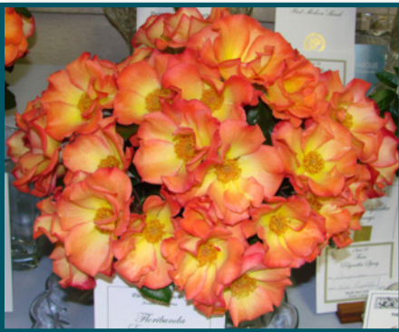
Lynn's Vase of 12 Playboy Floribunda 2010 Pacific RS Rose Show