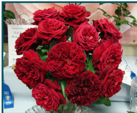
Lynn's Vase of 12 The Squire Shrub 2011 Pacific RS Rose Show