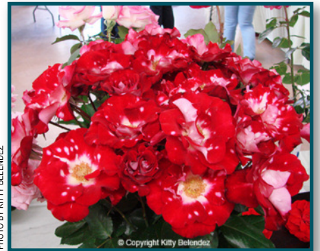
Lynn's Vase of 12 Ladybug Floribunda 2013 Pacific RS Rose Show