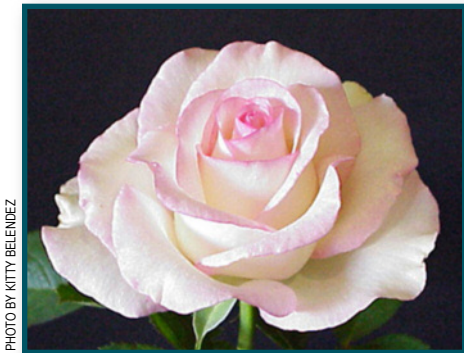
Lynn's Moonstone, Queen, Santa Clarita 2005